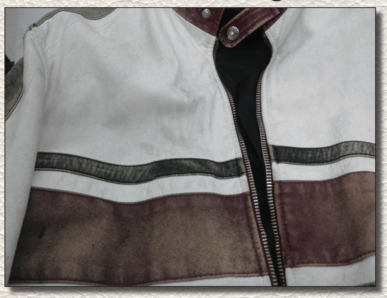
Dolce & Gabana Leather Jacket