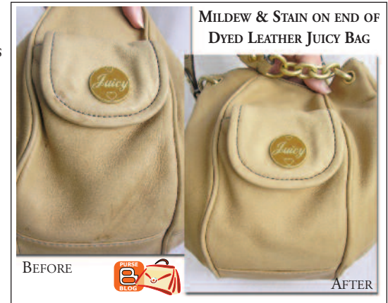
MILDEW & STAIN ON END OF DYED LEATHER JUICY BAG