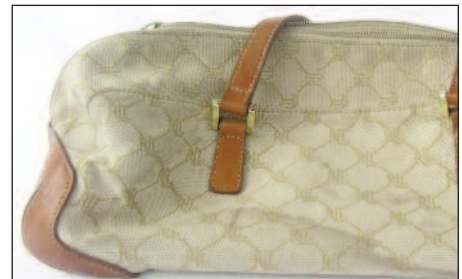
RALPH LAUREN BAG — BEFORE

Some designs, styles and materials of handbags lend themselves to being more durable over time. They're easier to clean and maintain. If you really enjoy your handbags, want to keep them nice, and use them at least through an entire season before purchasing again, consider some of these experiences we have had.