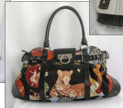
SALVATORE FERRAGAMO, STYLE: CARPET