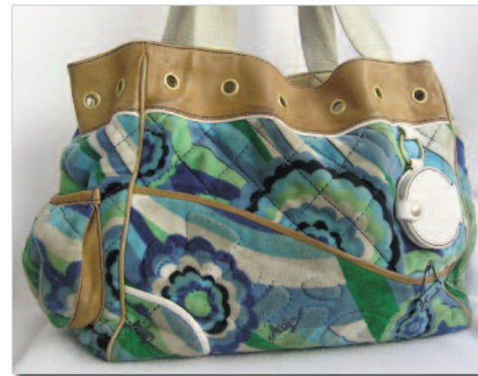
BEFORE... NOTE THE DIRTY WHITES