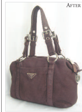
This Prada bag, sent to us from London, was unwittingly used as a receptacle for beer at a concert and then later washed in a washing machine. As with many suede handbags, the cleaning and restoration process required re-dyeing it.