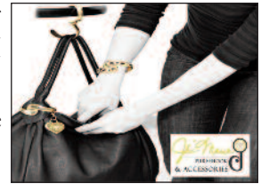
THE UNIQUE FUMI PURSE HOOK ACCESSORY AVAILABLE AT MARGARET'S