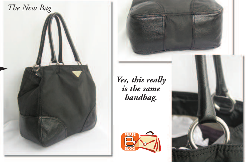
The New Bag