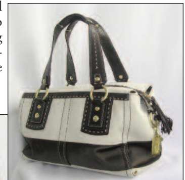
COACH STYLE: SAFARI

A host of different shapes and sizes exist, all with their own name and description. Pulito Purse Service is prepared to take on the cleaning and repair needs for any style of bag. The following page contains sketches of some of the most common purse shapes.