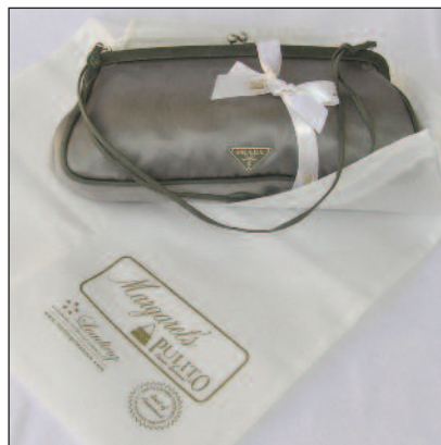
Margaret's Purse Storage Bags, one of our Boutique Wardrobe Products

Light colored leather straps on a handbag will darken over time because of the oils in your skin. Be especially careful with lotions when carrying such a bag.