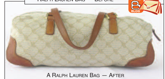
A RALPH LAUREN BAG — AFTER