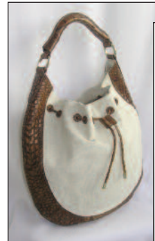
ELLEN TRACY STYLE: HOBO